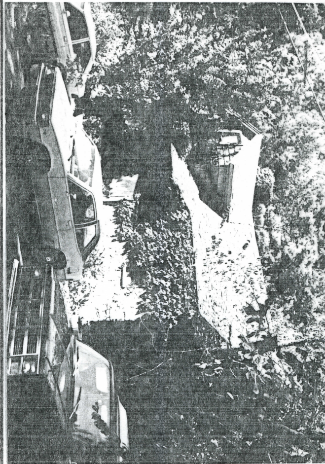
PHOTOGRAPHER FACING: N NE E SE S SW W NW PHOTOGRAPH NO. #4 Roll 3 PHOTOGRAPH DATE Summer, 1986 NEGATIVES AT Derry Historical Society